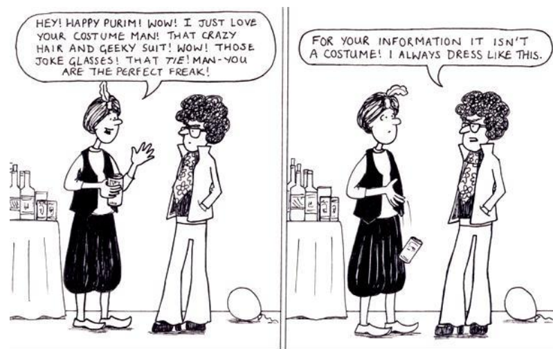
Purim social blunders

judithrcarey@verizon.net or (562) 421-2063.